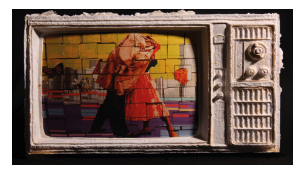
Medium – Cast cotton rag, archival inkjet printing on Hahnemuehle 'Monet' canvas Size - 15.5" x 25" x 3.5" Year of execution - 2011