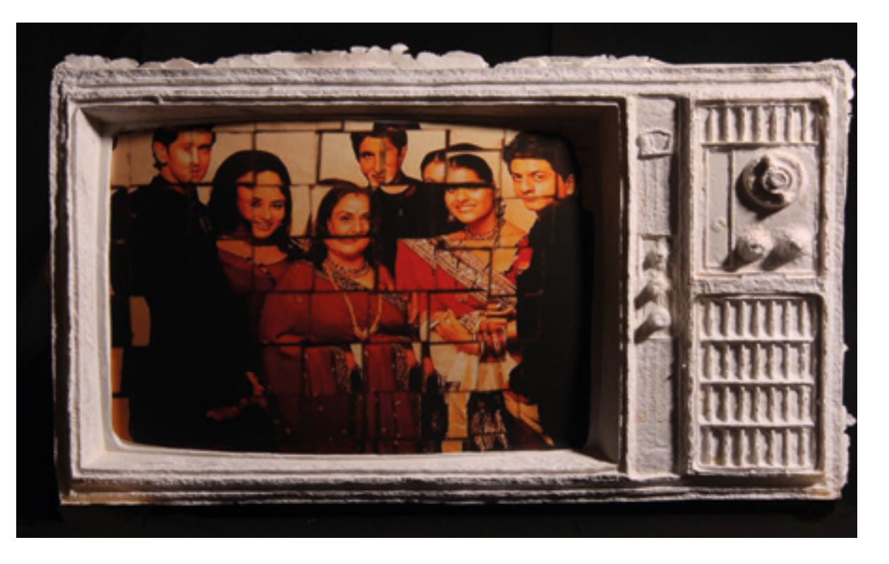
Medium – Cast cotton rag, archival inkjet printing on Hahnemuehle 'Monet' canvas Size – 15.5" x 25" x 3.5" Year of execution - 2011